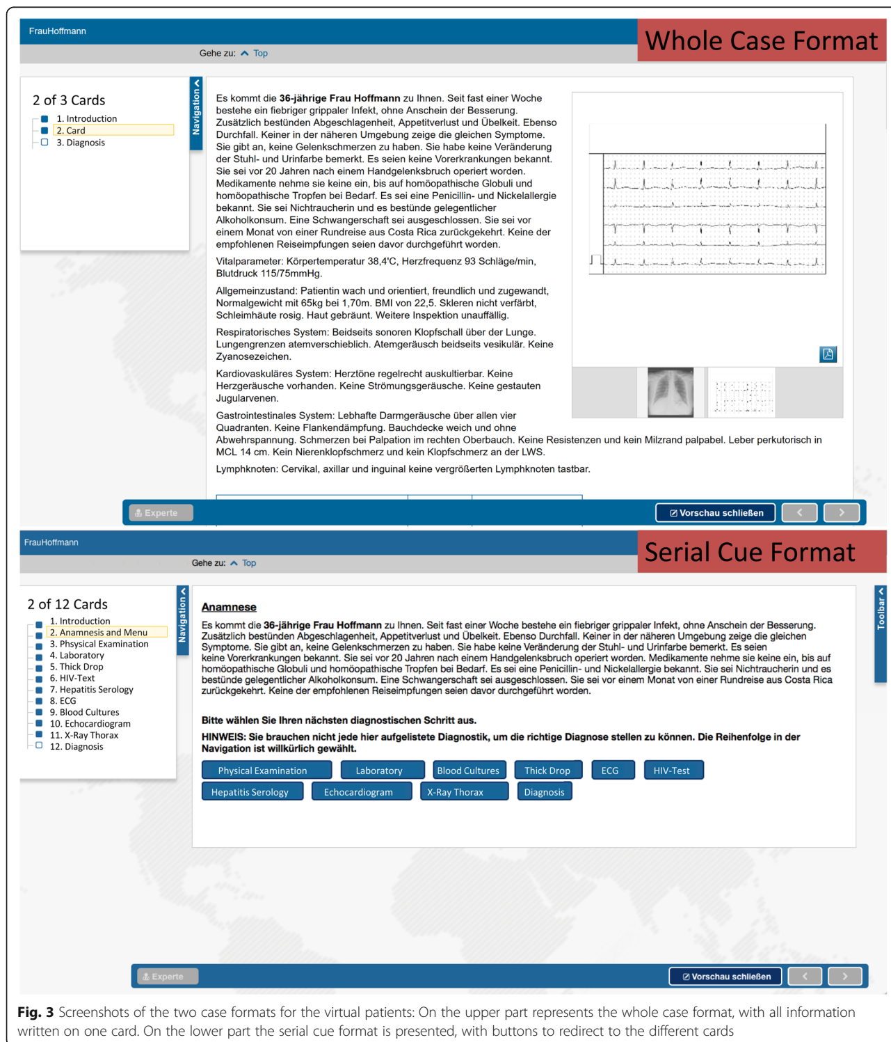
Fig. 3 Screenshots of the two case formats for the virtual patients: On the upper part represents the whole case format, with all information written on one card. On the lower part the serial cue format is presented, with buttons to redirect to the different cards

in additional extraneous cognitive load. Despite the growing number of design guides for VPs [1, 5, 6], there still is a research gap regarding how medical educators can best implement VPs in a way that students are not cognitively overwhelmed by the learning environment, especially those with low prior knowledge.