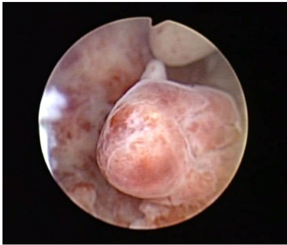
Fig. 1 Atypical polypoid adenomyoma seen on hysteroscopy (lesions located in the posterior wall of the uterine cavity, diameter 2.0 cm, irregular shape)