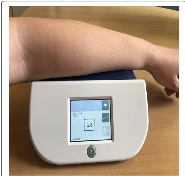
Fig. 2 Skin autofluorescence, as measured by the autofluorescence reader AGE reader mu connect (Diagnostics, NL). Local creams should not have been applied for 12 h. The examinee places the forearm of his/her dominant upper limb on the silicone armrest of the device. In this armrest, there is a small examination window for selection of a skin area. The elbow should be aligned with the edge of the armrest and no movements should be made during measurement. The examiner switches on the device using the power button. Activation is performed through the menu on the touch screen. AGEs result is shown on the screen. Approximate measurement duration is 30 s. Interpretation of results may be facilitated by available age- and sex-adjusted normative data

group reported that increased AGEs are linked with vascular endothelial growth factor (VEGF) overproduction (another major pathogenetic mechanism) [32]. Nevertheless, previous evidence is rather controversial, with a number of studies reporting lack of association with skin AGEs [23, 30, 34], others reporting a clear independent correlation with retinopathy [24, 25, 28] and disease severity [29], whereas, interestingly, macular oedema seems to develop independently of any increase in the levels of skin AGEs (Table 1) [26, 29].