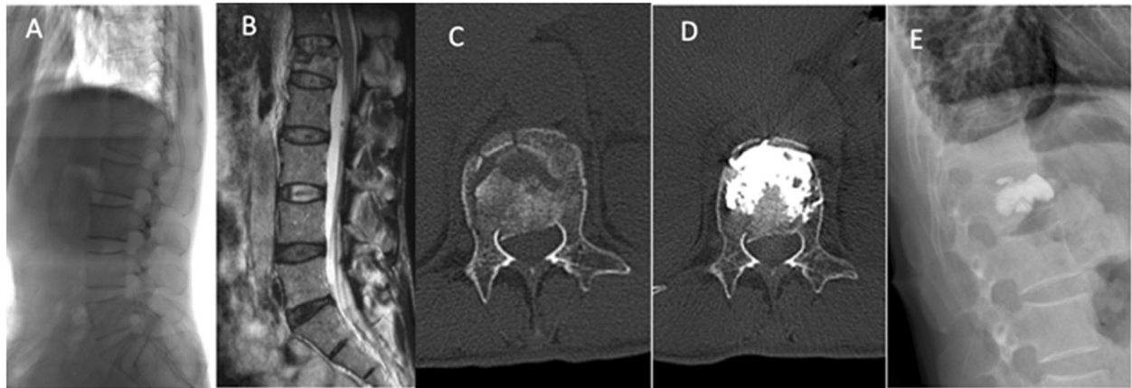
Fig. 3 Images of patient #2. a: X-ray radiographs before surgery; b: preoperative weighted MRI image of T2; c: axial CT image of L1; d: postoperative CT image shows that most of the fracture line is filled with cement without leakage; e: postoperative X-ray shows that the fracture line is filled with cement without leakage

environment for bone healing [31]. Since there is a fracture at the posterior 1/3 of the vertebral body in burst fracture, bone cement needs to diffuse to the posterior 1/3 of the region to stabilize the posterior fracture. Therefore, another key favorable role of vertebral augmentation is to prevent the displacement of the posterior fractured block by stabilizing the anterior part of the vertebral body or the posterior fractured block through the adhesive effect of bone cement (as in the cases 1 and 2 of the current study).