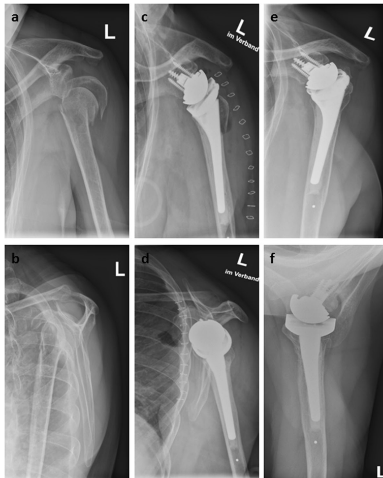
Fig. 3 Pre- a, b , postoperative c, d and follow-up images e, f of a 68-year-old patient with a 11-C2-fracture of the proximal humerus who was treated with primary reverse shoulder arthroplasty. At final follow-up after 36 months the Constant Score was 51 points. The lesser tuberosity healed in an anatomic position; however, the greater tuberosity was resorbed f

implanted; no further dislocation occurred. No prosthesis required removal during the study period.