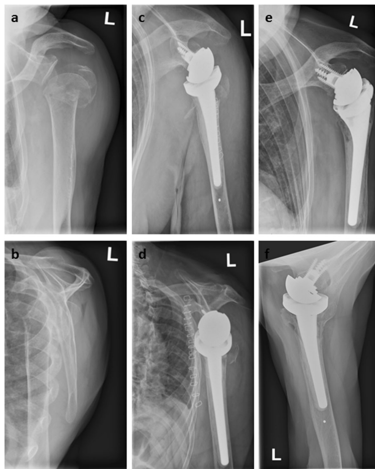
Fig. 2 Pre- a, b , postoperative c, d and follow-up images e, f of a 97-year-old patient with a 11-C2-fracture of the proximal humerus who was treated with primary reverse shoulder arthroplasty. At final follow-up after 24 months the Constant Score was 68 points. Both lesser and greater tuberosity are healed in an anatomical position e, f

The complication and revision rate was 5%. One case presented with a postoperative hematoma which had to be surgically addressed. Another patient suffered an atraumatic dislocation which was treated with revision surgery and a metaphyseal extension of 6 mm was additionally