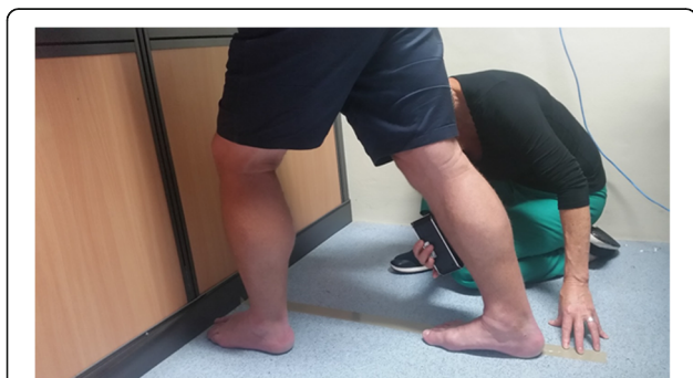
Fig. 2 Measurement of ankle joint dorsiflexion using a Lunge test with knee extended

One hundred and thirty-six people with diabetes and 30 people without diabetes were recruited for the study (Table 1). The diabetes group were older, heavier, had a higher body mass index (BMI) and less weight bearing and non-weight bearing range of ankle dorsiflexion than the non-diabetes group ( p < 0.01 ). There were no