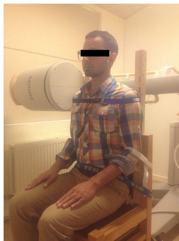
Fig. 1 shows the experimental chair with the subject in the sitting position. Straps around shoulders, elbows and waists were used to restrict movements below the cervical spine

Two flexion movements followed by two extension motions were recorded from upright to end range. The static position at the beginning of each motion was recorded for 2 s, and the baseline image was extracted from these 2 s. The outcome image was recorded with 4 s delay at the beginning of the second repeated motion (Table 1). Thus the recordings included the baseline