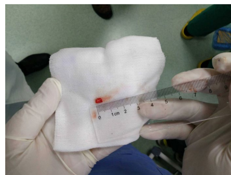
Fig. 2 Lung tissue obtained by transbronchial lung cryobiopsy

Insert the soft bronchoscope via the nose, enter the trachea through the glottis from the trachea catheter, empty the capsule, and then enter the bronchus. Place the guide wire into the bronchus of the intended biopsy segment through the bronchoscope working passage, and exit the bronchoscope after the catheter is in its place. Fill the capsule and fix the guide wire, and then the guide wire will be strengthened by the respiratory therapist who is responsible for mechanical ventilation so that it will not displace.