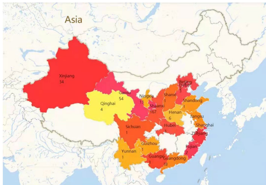
Fig. 1 Geographic distribution of participants by province. Note: different colors represent different provinces)

They were: (1) workers' concern about extremely high temperature; (2) perception of high temperature injury; (3) attitude towards strengthening training; (4) attitude towards more heat-related policies and guidelines; (5) the change of work habits; (6) the degree of satisfaction with the current heat prevention measures; (7) the degree of reduced work efficiency due to heat. The "SVY" commands of Stata were used to calculate odds ratios (OR) and 95% confidence intervals for the prevalence estimates [34]. Bivariate and multivariate logistic regression analyses were conducted using a stepwise backwards procedure to identify factors associated with the perceptions of heat exposure in the workplace. All variables with statistical significance of p < 0.05 were included in the final model.