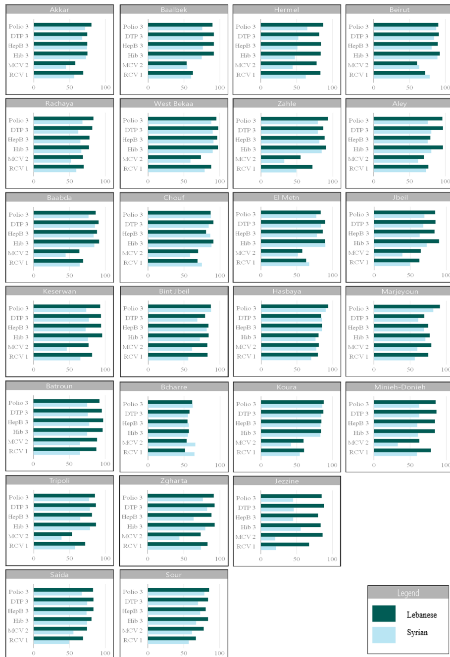
Fig. 1 Routine vaccination coverage at the district level among children aged 12–59 months, Lebanon CES 2016

50.9–70.7] in Bcharre to 95.9% [95% CI: 93.4–97.4] in Aley among Lebanese and from 45.0% [95% CI: 21.6–47.5] in Jezzine to 90.2% [95% CI: 81.5–95.1] in Hasbaya among Syrians. Similar variations were identified for all doses and all types of vaccines. However, the majority of districts presented an immunization level at the upper end of the targeted coverage. It was noted that more than 90.0% coverage of the first dose of polio was observed in all districts for Lebanese children, with the