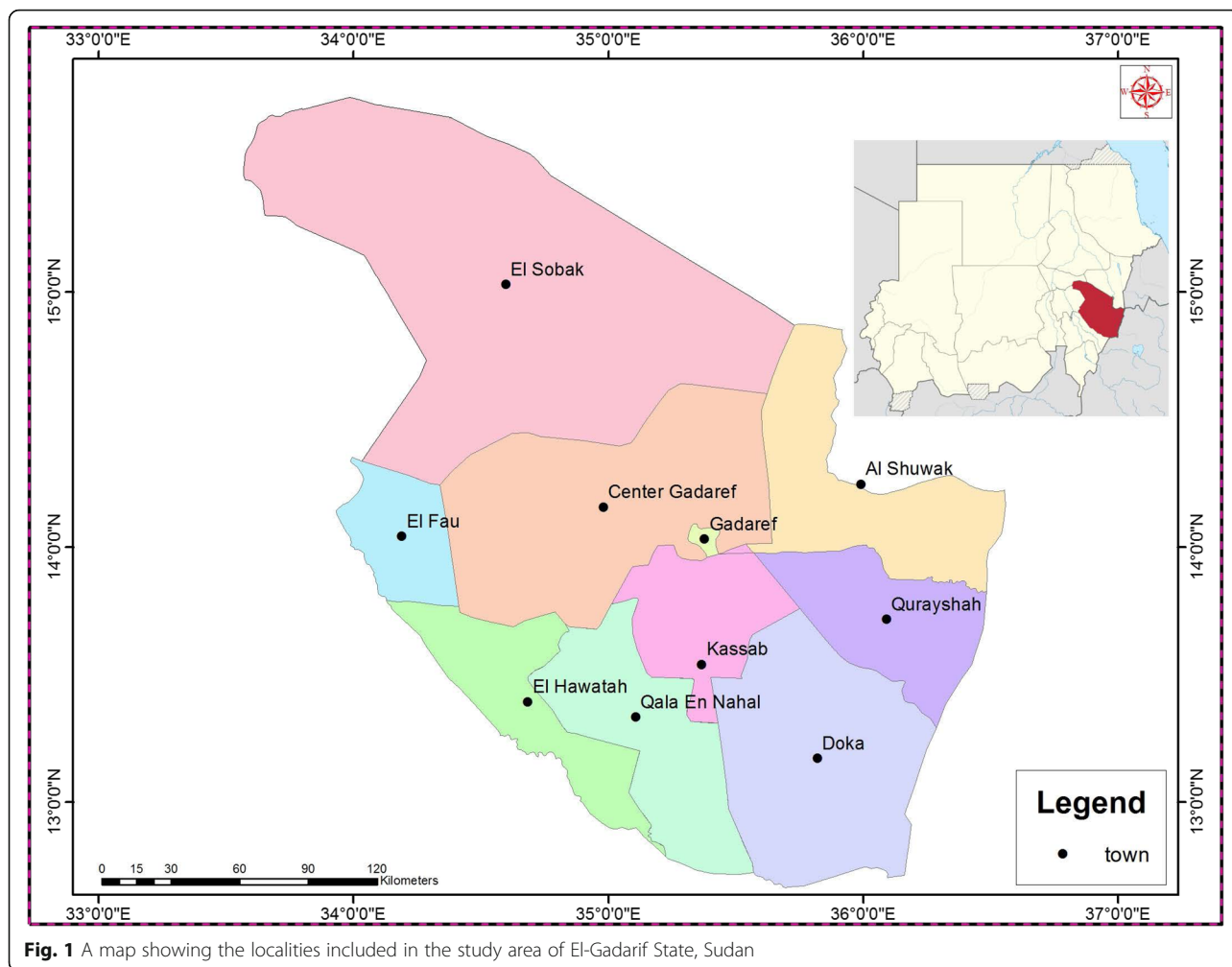
Fig. 1 A map showing the localities included in the study area of El-Gadarif State, Sudan

or without symptoms. We excluded from the study those who have history of travelling to endemic area within last 2 weeks.