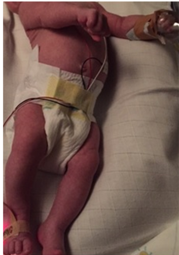
Fig. 2 The infant at presentation at the emergency department showing clear signs of opisthotonos (placed with permission of the parents)

The patient was transferred to a neonatal intensive care unit (NICU) for intensive monitoring, concerning the possible risk of cardiac rhythm disturbances and convulsions. Laboratory testing was performed including a complete blood count, infection parameters and electrolyte concentration, all results were within normal limits. Because of the risk of convulsions and