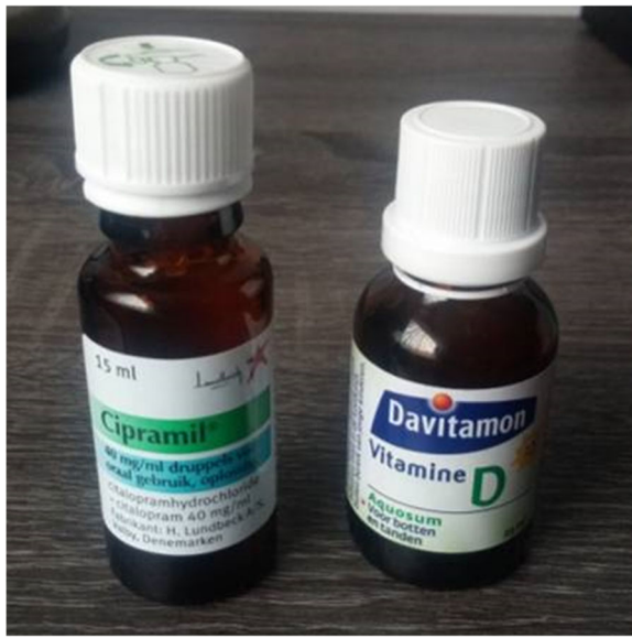
Fig. 1 Photo showing the citalopram (left) and vitamin D (right). (Picture provided by the parents)

because he had accidentally been given the mothers' dose of citalopram. Instead of the vitamin D drops she intended to give him, she accidentally switched bottles of the citalopram and vitamin D. These bottles are similar, as shown in Fig. 1. The mother noticed the incorrect medication bottle around 30 min later and immediately presented the infant to the emergency department. She administered 10 drops of citalopram, corresponding to 20 mg. With a weight of 3355 g corresponding to a dose of around 6.0 mg/kg.