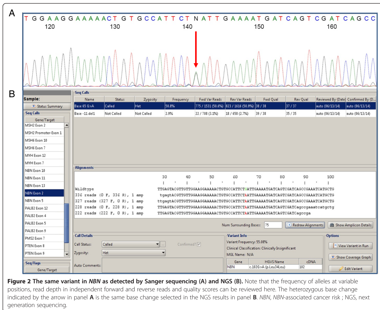
Figure 2 The same variant in NBN as detected by Sanger sequencing (A) and NGS (B). Note that the frequency of alleles at variable positions, read depth in independent forward and reverse reads and quality scores can be reviewed here. The heterozygous base change indicated by the arrow in panel A is the same base change selected in the NGS results in panel B. NBN , NBN -associated cancer risk ; NGS, next generation sequencing.

Software. The analysis was performed by in-house-developed software using sample dosage normalization, locally weighted scatterplot smoothing normalization, historic probe normalization, and custom GC normalization (Figure 3).