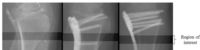
Fig. 2 Lateral scoutviews of each instrumented radius showing the region of interest (ROI) in each radius. The ROI was chosen at a location where the radius was fully covered by a part of the plate without holes and that was not intersected by screws. The tantalum fibers in the CFR-PEEK plate ( left ) allow visualization of the plate

Means for the bone parameters in each instrumented and uninstrumented radius were calculated from the duplicate measurements. The errors in the bone parameters introduced by each plate were expressed as percent differences