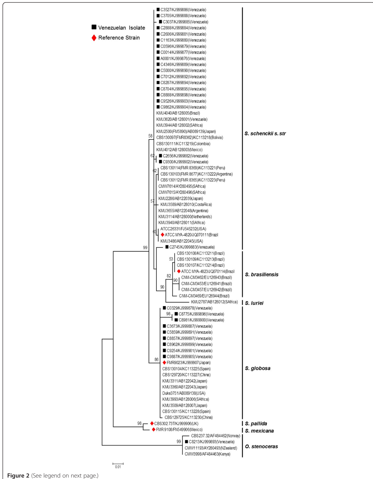
Figure 2 (See legend on next page.)