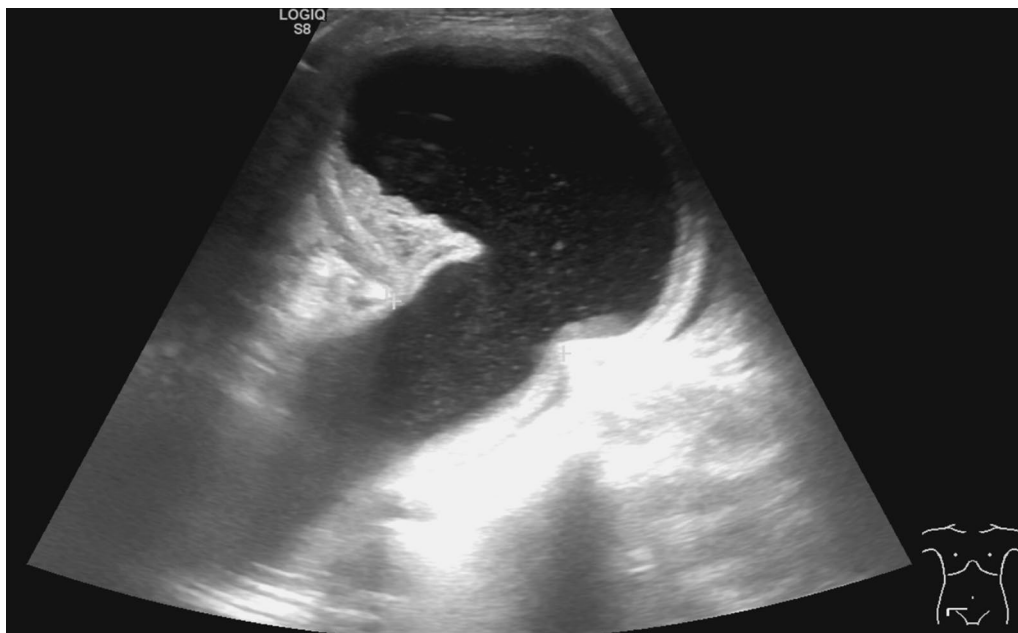
Fig. 1 Preoperative abdominal ultrasound showed an oedematous intestinal loop in a 70-mm-long hernial sac protruding via a 30-mm hernial orifice

Exploration was performed via an inguinal incision on the right side. In contrast to the abdominal ultrasound finding, an uncertain cystic structure was found in the hernial sac and several small, solid, abnormal masses were palpated in this structure (Fig. 2a). The lesion seemed to be a gynaecological lesion, not an intestinal loop. As regards the uncertain, bizarre finding, the abdominal cavity was explored from the middle midline laparotomy. During the exploration, the content of the hernial sac was found to be the fundus of the significantly ptotic, large gallbladder containing cube-shaped stones palpated earlier during the inguinal exploration. An intramural haemorrhage was observed in this region of the gallbladder, but no clear necrosis was detected (Fig. 2b). There were no signs of inflammation in the hilum of the gallbladder during the surgery. Therefore, a retrograde cholecystectomy and Bassini's repair of the inguinal hernia were performed safely, and according to our Department protocol a fine silicone drain was left in the omental foramen of Winslow.