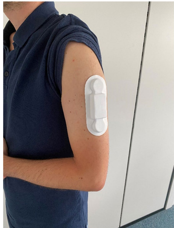
Fig. 1 SmartCardia device especially dedicated for SpO 2 measurement

The protocol required brief stable arterial oxygen desaturation in healthy volunteers and sampling arterial blood