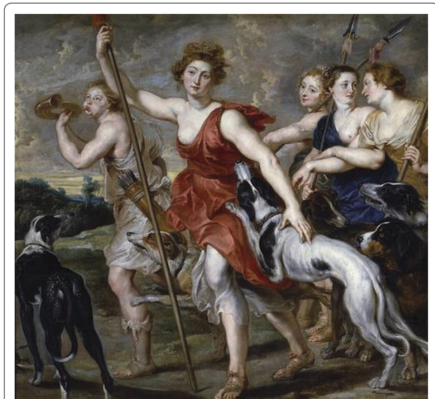
Figure 3. That at least some people, and often trend-setters, have long valued dogs is reflected in their prominence in art from Neolithic times to the present. In this case, Rubens pictures Diana (Artemis) the goddess of hunting, with a hound center stage.

Indeed, the recent radiation of modern breeds in the Victorian era followed lines of class and wealth, and may be a modern example of the process. Thus, despite the fact that in many contemporary indigenous societies dogs appear to be only loosely owned and little valued, it does not seem implausible that early dogs were valued by their companion humans. Such value would make them objects of inter-generational wealth, and hence qualify as a vehicle for inequality. The fact that contemporary primitive societies often treat dogs badly does not mean that some individuals do (and did) not value them, and to judge by their depictions alongside goddesses like Rubens' Diana (Figure 3), one might guess that some of the people that valued them were trend-setters!