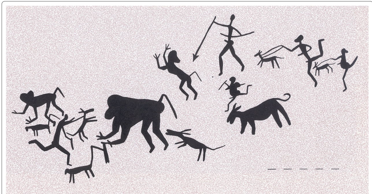
Figure 1. Petroglyphs from Drakensberg of South Africa illustrating an early hunt with dogs in a manner perhaps analogous to that of the earliest hunter gatherers. Picture used with permission from Vinnicombe P. 1979. People of the Eland: Rock paintings of the Drakensberg Bushmen as a reflection of their life and thought. Pietermaritzberg: University of Natal Press.

subject to a strong sex bias [4]. Moreover, wolves are highly mobile, resulting in scant geographic patterning in their genetics and, worse, dogs can interbreed with regional native wolf populations [4,13].