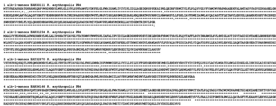
Figure 3 Amino acid sequence alignment of the four new alkane hydroxylases from R. erythropolis strain 4 from Lake Baikal with another strain already in the literature ( R. erythropolis PR4). Conserved regions (*), synonymous substitutions (.), significant substitutions (:), and unspecified substitutions ( ).

The alkane hydroxylase amino acid sequence homologies between R. erythropolis strain 4, R. erythropolis SK121 and R. erythropolis PR4 are remarkable for the following reasons: strain SK121 (Hamamura et al. 2008) was isolated from oil contaminated soil and tends to utilise aromatic hydrocarbons. Strain PR4 was isolated at a depth of 1 km from the Pacific Ocean and is unable to utilise arenes, but does use n -alkanes with chain length of C 8 -C 20 as the sole energy source (Sekine et al. 2006). The R. erythropolis strain 4 was isolated from the inner part of bitumen mound, located on the bottom of Lake Baikal and tends to utilise n -alkanes with a broader chain length (C 12 -C 29 ). This adaptation could be explained by