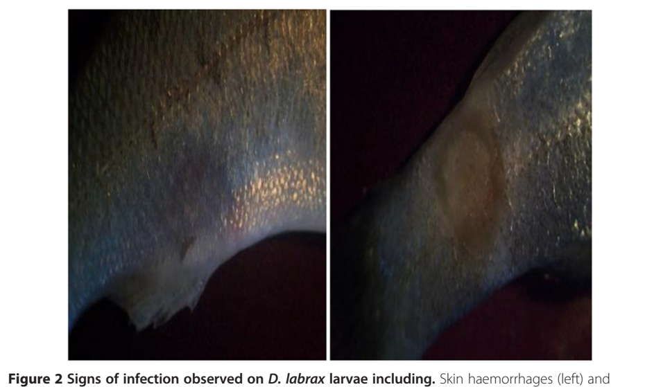
necroses (right) after infection tests.

Only two strains isolated from sea bass (S5 and S4) were found to be serum sensitive. The survival curves of V. parahaemolyticus strains in sea bass serum are shown in Figure 3. The two strains showed different profiles: (A) strains that resisted the bactericidal action of the serum and were capable of proliferating, and (B) other strains that showed sensitivity to the serum and of which the percentage of survival decreased.