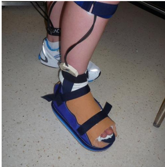
Figure 2 The shoe-cast condition. Cast walls were removed from the TCC leaving a well moulded shoe-cast condition.