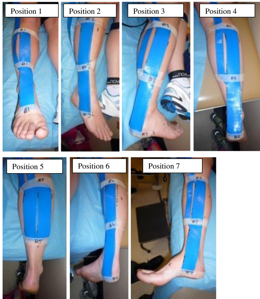
Figure 1 Orientation of sensors used to measure cast wall pressures at the seven different locations.

and cast wall data. The data from seven locations of the cast wall were synchronised for comparison at the same temporal events.