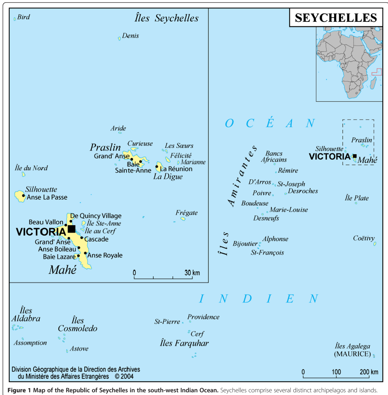
Figure 1 Map of the Republic of Seychelles in the south-west Indian Ocean. Seychelles comprise several distinct archipelagos and islands.

reaching 20% in Port Glaud, on Mahé, and 17% in Praslin. In the vector, nine natural infections were found in 429 Culex quinquefasciatus (= 2.1%) collected at Port Glaud, with one mature Wuchereria bancrofti larvae [13]. Natural infections and experimental transmission showed that Cx. quinquefasciatus is the main and probably only vector in the Seychelles.