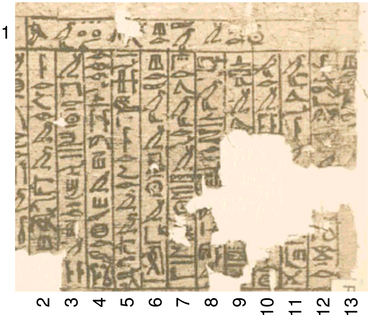
Figure 1 Last section of the damaged Veterinary Papyrus of the Kahun Papyri about the cattle disease ushau dating from 2 nd millennium BC. The translation reads as follows: (1) Title: Treatment of the eyes (?) of a bull with ushau in winter. (2) If you see a bull with ushau (3) in winter, and he is blinded (?), (4) his two eyes are thick; gash thou as (5) above. If you see a bull (6) with ushau in winter from cold, (7) since its arrival in (?) the summer, (8) his temples are wrinkled (?), his eyes are running, his stomach groaning (?), (9) he does not walk (?) .....(10) ..... (11) ..... (12) thou all his body with ..... as is done to one (13) with a bruise (?) [11].