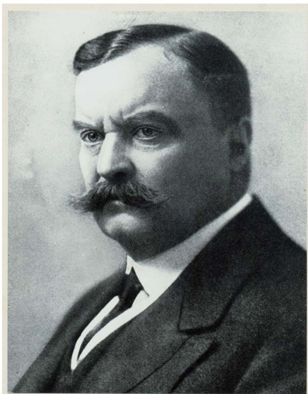
Figure 2 Sir David Bruce (1855–1931). The Scottish bacteriologist identified T. brucei as the aetiological agent of nagana disease.

1929) who in 1916, with the help of a small team of chemists and the German chemical and pharmaceutical company Bayer, developed the first effective drug for treatment of sleeping sickness. The compound, Bayer 205, (later named suramin) is still in use in the therapy of early-stage T. b. rhodesiense infections [2]. A year earlier, the American chemist Walter A. Jacobs (1883–1967) and the American immunologist Michael Heidelberger (1888–1991) discovered the organo-arsenical trypanosamide. This was the first drug to treat late-stage sleeping sickness alone, or in combination with suramin, and was also employed in the treatment of animal trypanosomiasis [26]. Both drugs helped to fight the second major sleeping sickness epidemic which began in a number of African countries in 1920 and died down by the late 1940s (Fig. 3) [3,27]. Another important measure towards the control of the 1920s sleeping sickness epidemic was the introduction of mobile teams [20]. This method of systematic case detection and treatment with the aim of elimination of the parasite reservoir was suggested by the French military surgeon Eugène Jamot (1879–1937). In 1926, after long opposition by his superiors in Paris, Jamot was allowed to set up a special service in Cameroon that showed the effectiveness of his approach; within 11