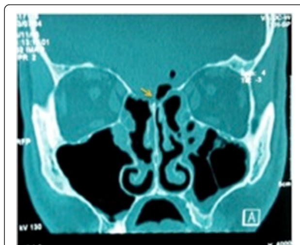
Figure 1 Postoperative pneumocephalus following FESS.

Coronal CT scan demonstrates a minimal amount of pneumocephalus (Yellow arrow) and defect in the left ethmoid roof adjacent to the middle turbinate insertion following FESS.