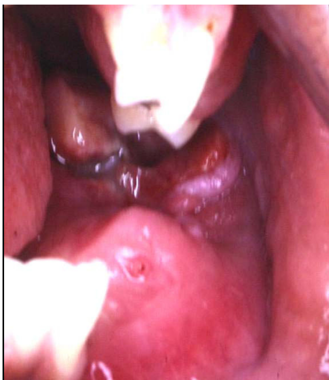
Figure 2 Clinical intraoral examination showing tissue proliferation which inverted the fundus of the buccal pouch from the region of tooth 33 to the retromolar triangle.

characterized by the presence of solid areas containing numerous oval, round, spindle-shaped or elongated irregular pleomorphic cells, intermingled with numerous irregular fragments of mineralized bone containing various cells and abundant osteoid tissue (Figure 4A).