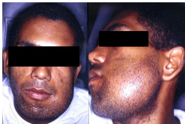
Figure 1 Extraoral examination showed a swelling causing deformity of the left mandibular body.

The anatomopathological exam was conclusive and the diagnosis was osteoblastic osteosarcoma. The tumor was