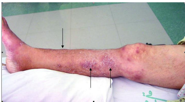
Figure 1 Erythema-nodosum-like lesions of the leg and thigh.

Since a fungal etiology of the skin lesion was established, the involved tissues were surgically resected, followed by intravenous treatment with amphotericin B (1 mg/kg/day). After 7 days of antifungal therapy, the patient's serum creatinine concentration had increased to 2.5 mg/dL; hence we had to decrease the dose of amphotericin B to 0.5 mg/kg/daily, and continue treatment until she had