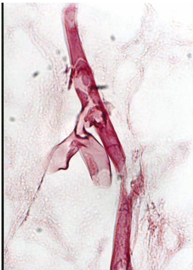
Figure 3 Broad, aseptate and thin walled fungal hyphae having irregular, non-parallel contours, with right angle branching indicative of mucormycosis (PAS × 1000).

disease form, whereas no patient had cutaneous mucormycosis [8].