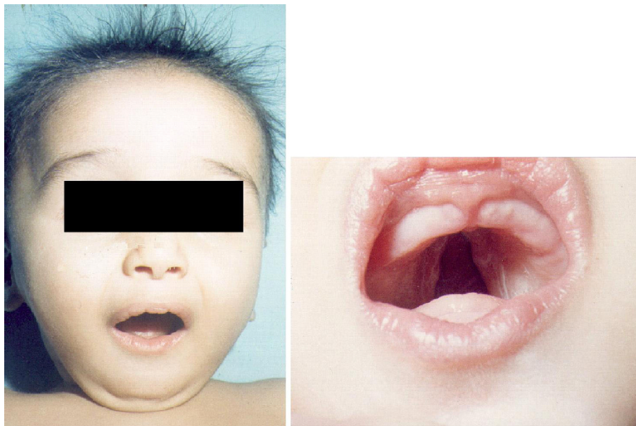
Figure 3 Bamforth- Lazarus syndrome. An 8 month old infant with a homozygous mutation in the TTF-2 gene locus leading to congenital hypothyroidism. Phenotypic features include, low set ears, extensive cleft palate, hypertelorism, spiky hair and low posterior hairline. (Taken from; A novel loss-of-function mutation in TTF-2 is associated with congenital hypothyroidism, thyroid agenesis and cleft palate; Human Molecular Genetics , 2002, Vol. 11, No. 17. Courtesy Dr. Michel Polak and the Oxford University Press.)