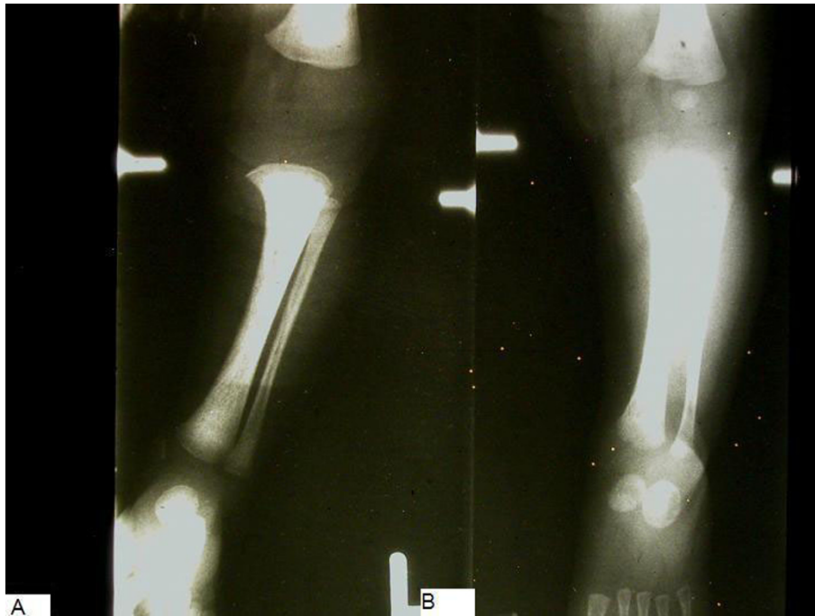
Figure 2 Radiograph of the left lower extremity of two infants, showing absence of the distal femoral epiphysis on left. Radiograph of the left lower extremity of two infants. The infant on the left with congenital hypothyroidism demonstrates absence of the distal femoral and proximal tibial epiphyses, while in the normal infant on the right the distal femoral epiphysis is present.