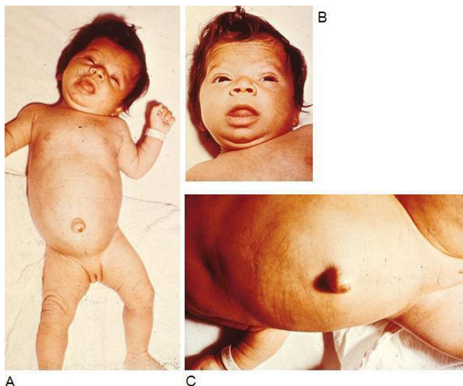
Figure 1 Infant with congenital hypothyroidism. A - 3 month old infant with untreated CH; picture demonstrates hypotonic posture, myxedematous facies, macroglossia, and umbilical hernia. B - Same infant, close up of face, showing myxedematous facies, macroglossia, and skin mottling. C - Same infant, close up showing abdominal distension and umbilical hernia.

of thyroid dysgenesis, choanal atresia, cleft palate and spiky hair also known as Bamforth-Lazarus syndrome [22] (Figure 3). Mutations in NKX 2.1 causes congenital hypothyroidism associated with respiratory distress and neurologic problems such as benign hereditary chorea and ataxia [23-25].