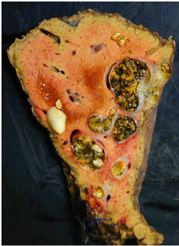
Figure 3 LPAC syndrome associated with the presence of intrahepatic non cystic bile duct dilatations filled with cholesterol gallstones.