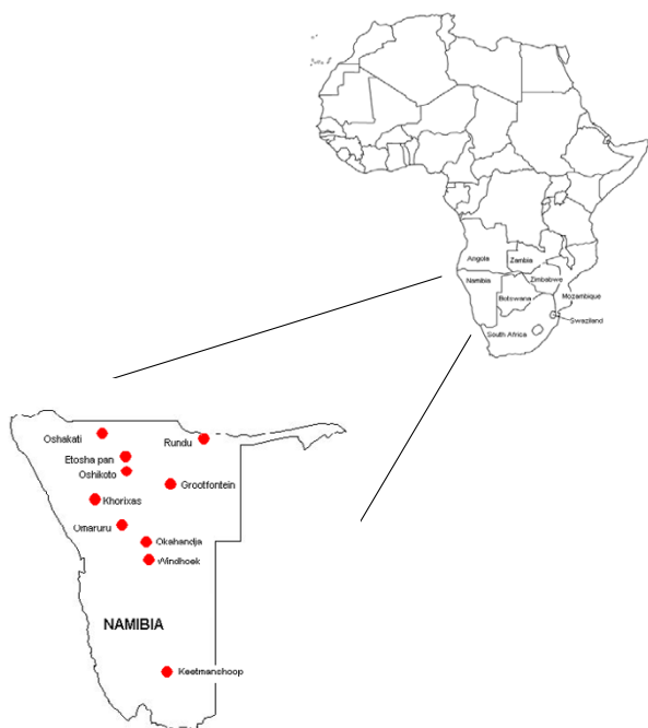
Figure 1 Map showing the location of Namibia within the African continent and the location of Namibian isolates.

In addition to RABV, the lyssaviruses circulating in Africa include Lagos bat virus (genotype 2), Mokola virus (genotype 3) and Duvenhage virus (genotype 4) [1]. Classical rabies viruses circulating in southern Africa can be further sub-divided into two distinct biotypes, canid and viverrid [2]. Monoclonal antibody typing has confirmed the existence of these two distinct groups, with the wildlife-associated mongoose (viverrid) biotype appearing more phylogenetically diverse [2-5]. The canid biotype infects carnivores of the family Canidae, primarily the domestic dog ( Canis familiaris ), jackal ( Canis mesomelas , the black-backed jackal) and bat-eared foxes ( Otocyon megalotis ) [5]. The mongoose (viverrid) biotype principally infects the yellow mongoose ( Cynictis penicillata ) which maintains the virus, whereas in reality there is no evidence that true viverrids (such as civets and genets) are maintenance hosts of RABV [5]. Mongoose rabies is likely to have been endemic throughout southern Africa (including Namibia) prior to the advent of canine rabies. Although of importance over the vast area of southern Africa, mongoose rabies is less threatening to human and animal health and is consequently difficult to trace in history [5].