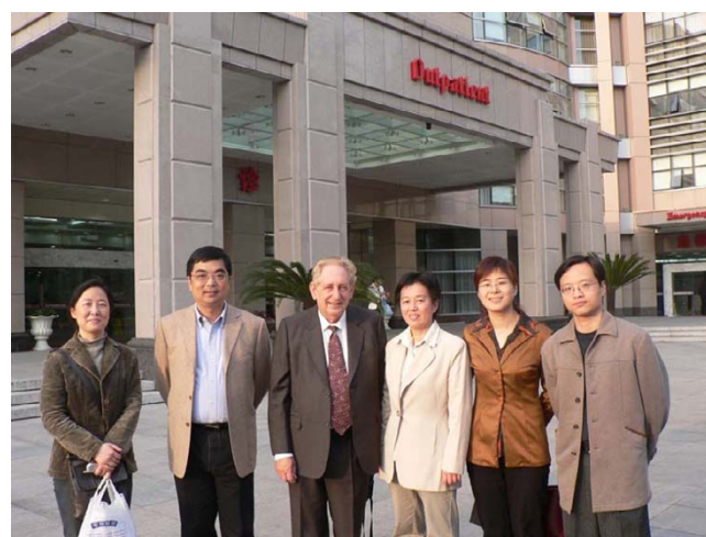
Figure 4 Authors (XX 2nd from left, CWB and LQ) and Hospital Staff, Women's Hospital, School of Medicine, Zhejiang University, PR China.

This is the first longitudinal cohort study published on infant feeding practices in city, suburban and rural areas in Zhejiang province, an economically advanced area typical of eastern China. The overall 'any breastfeeding' rate was high before discharge at 96.5% in city, 96.8% in suburban and 97.4% in rural areas. The 'exclusive breastfeeding' rates in city, suburban and rural areas before discharge were 38.0%, 63.4% and 61.0%. The exclusive