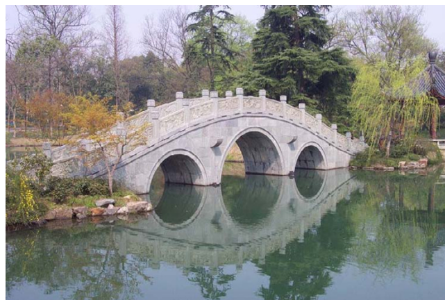
Figure 1 West Lake, Hangzhou.

Zhejiang Province is located on the east coast of China, south of Shanghai and in 2006 had a population of 49 million. Since the Chinese economic reforms began 30 years ago, Zhejiang Province has developed its economy, education and health care systems and has become one of the most prosperous regions in the nation. The capital of Zhejiang Province is Hangzhou, a city of four million, first made famous when Marco Polo was appointed its governor in the 12 th century. Hangzhou has become the centre of large information technology and electronics industries (Figure 1). Like other large cities in China, in Hangzhou, the breastfeeding rate declined with the introduction of western patterns of obstetric services. However, after the nationwide launch of the Baby Friendly Hospital Initia-