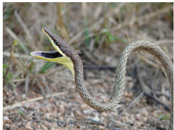
Figure 28 Oxybelis aeneus (Wagler, 1824).

Comments: A small to medium sized snake with a large geographic distribution [115]. This species can be found from south Arizona in North America, throughout Central America and most part of South America. In Brazil it inhabits all biomes occurring in open and forest environments. In Caatinga this snakes occurs in all environments. This species is arboreal and diurnal feeding primarily on lizards, but small frogs can also be consumed [109]. The preys are killed by envenomation.