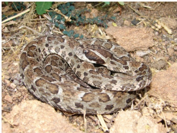
Figure 24 Bothropoides erythromelas (Amaral, 1923).

Ethnozoological notes: This species is one of the most feared by the inhabitants of the semi-arid region of Brazil. Because of its potential for lethality, it represents a risk for people and domestic animals, which is why members of this species are normally killed when they are found. However, products of this species are used for different purposes. Although it is not typical, in some localities, the meat of the species is consumed as food. Marques and Guerreiro [65] have reported that snake meat snacks were being sold for approximately US$1.50 in the public marketplaces of Feira de Santana, Bahia. The fat of a rattlesnake is used in popular medicine for