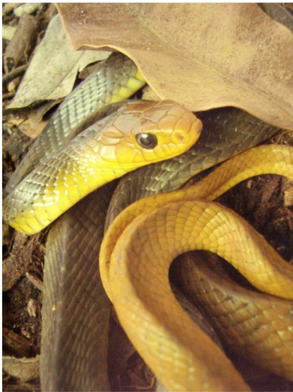
Figure 26 Drymarchon corais (Boie, 1827).

Comments: A small to medium sized snake, distributed in forest and open environments (Caatinga, Atlantic Forest and Amazon) [114]. This species is diurnal and arboreal, the diet is based primarily on amphibians but