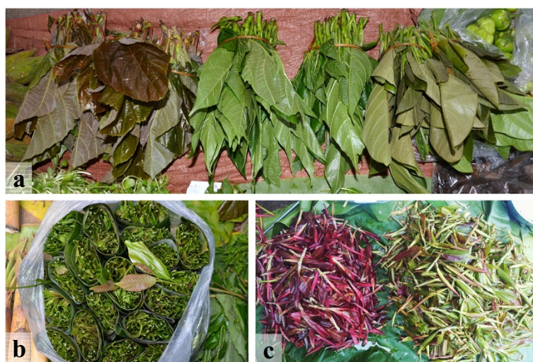
Figure 1 Some examples of Ficus vegetables sold in local markets in Xishuangbanna, SW China. From left to right: young leaves of F. auriculata , F. racemosa and F. callosa tied using bamboo sliver (a); Young leaves of F. vasculosa wrapped in leaf slices of genus Musa L. (b); Piles of red and green leaf buds of F. virens on the leaves of genus Musa L. (c).

In the Dai language, names of wild plants used as vegetables are often preceded by “pàk”. The words “liāng” (reddish), “xiū” (green), “háo” (white), “núi” (smaller) and “lōng” (bigger) are often added to discriminate the edible parts of similar fig plants. Some Ficus forms