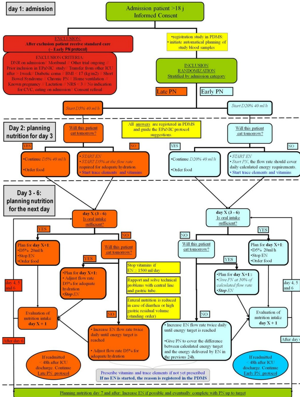
Figure 2 Trial procedures flow sheet.

Discrete variables will be summarized by frequencies and percentages. Continuous variables will be summarized by use of either mean or standard deviations (SD) or median and interquartile range as appropriate.