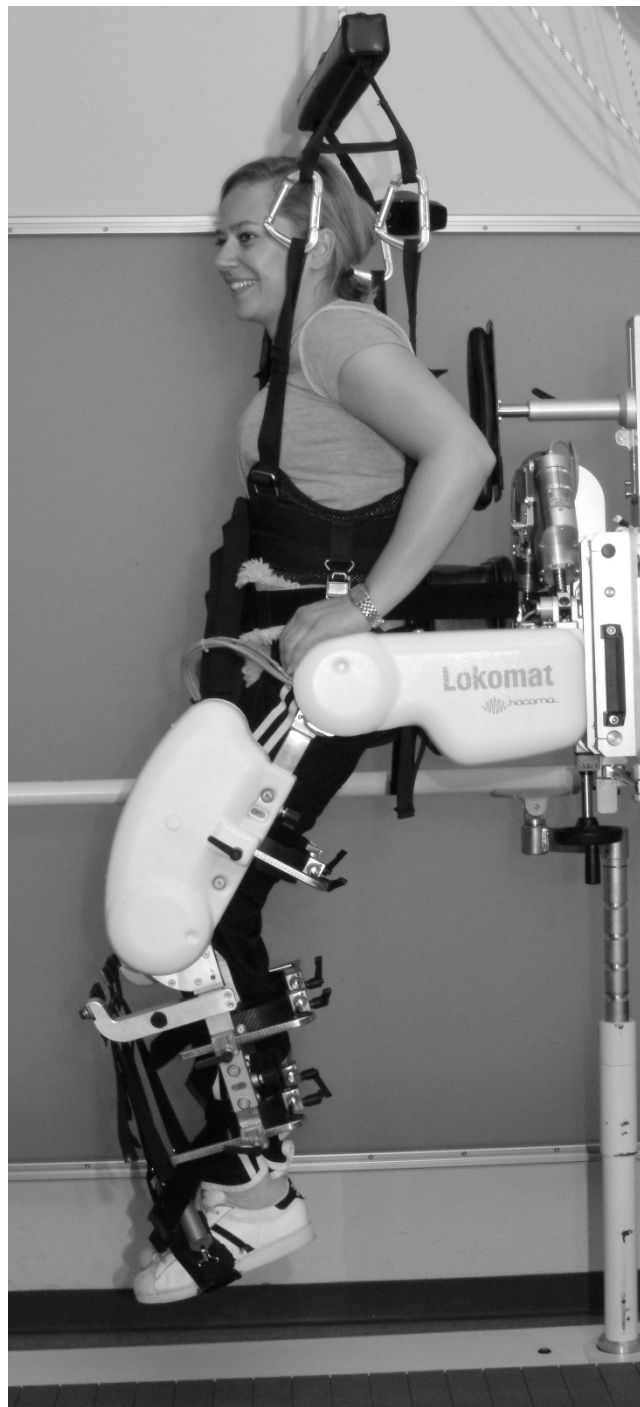
Figure 1 Measuring position of subject in DGO. Subject in the position used for the force measurement in the DGO. The device is set to position control mode with preset fixed joint angles (hip 30° flexion, knee 45° flexion).

The DGO Lokomat is used in combination with a treadmill and a dynamic body weight support system. The DGO controls the patient's leg trajectories in the sagittal plane during walking [14,15]. The hip and knee joints of the DGO are actuated by linear back-drivable actuators integrated into an exoskeleton structure. In every actuator, a force transducer measures the linear forces, whereas potentiometers measure the actual joint angles. The torques acting on each joint are calculated online from these position and linear force values based on the known geometry. For the isometric force assessment, subjects wear a harness and are fixed to the DGO by straps around the trunk and the pelvis. The legs of the device are attached to the subject's legs with cuffs around the thighs and calves. Proximal and distal leg structures of the DGO are adjusted to align hip and knee joints of the subjects with the joint axes of the DGO. Subjects are lifted above the treadmill (unloading from 100% body weight) and the software sets the device to position control mode with preset fixed joint angles (hip 30° flexion, knee 45° flexion; see Figure 1). In this position subjects are asked to perform either a flexion or extension movement in hip or knee joint in left or right leg and push against the orthosis legs according to a defined sequence of tests. The system