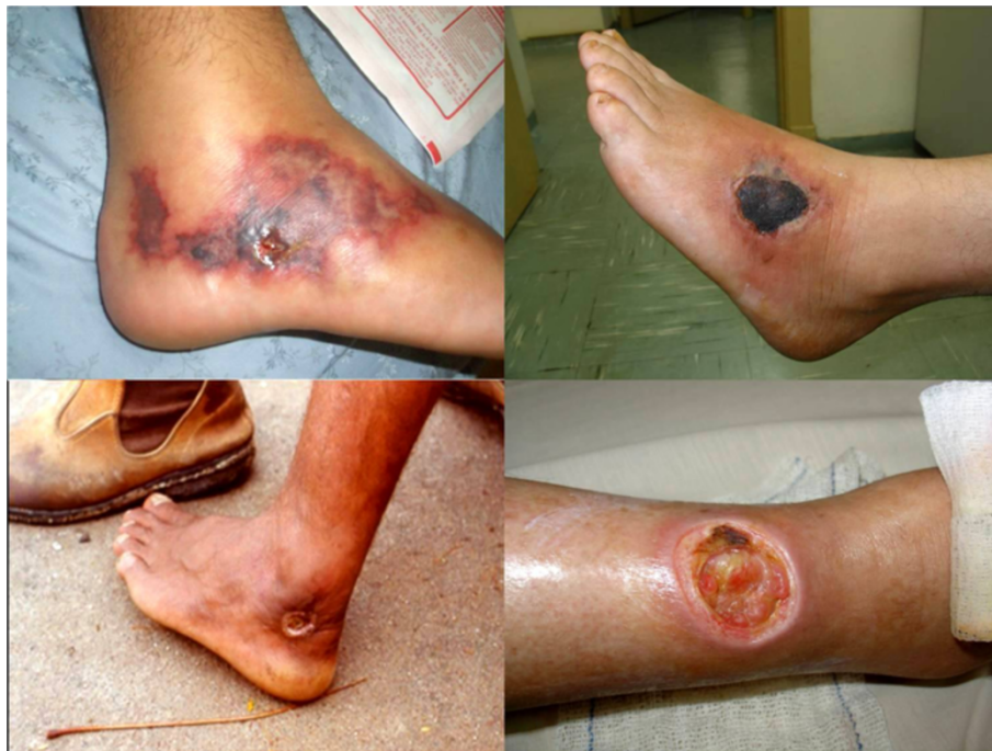
Figure 8 Extensive necrosis on the lower limbs of amateur and professional fishermen of the central regions of Brazil. Envenomations by freshwater stingrays tend to cause skin necrosis and chronic ulcers in the victim, who in most cases had stepped on the stingray in shallow waters.