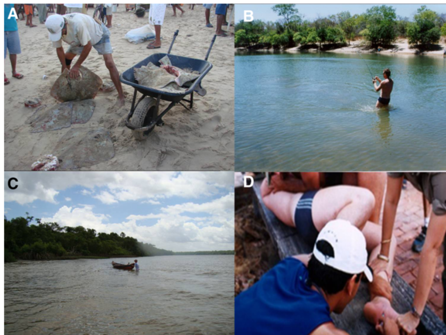
Figure 4 Environments with high risk of injuries by stingrays. (A) A fisherman handling marine stingrays in a fish market. (B) An amateur fisherman was fishing in a tributary of the Araguaia River (Midwest region of Brazil) when he was injured by a freshwater stingray. (C) A fisherman pushes his boat into shallow waters of a tributary of the Amazon River where rays are common: the risk of envenomation is high. (D) The pain of the man in (B) was excruciating.