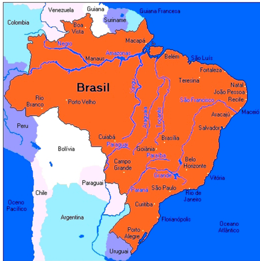
Figure 1 Map of Brazil in South America showing the Atlantic coast and the Amazon, Araguaia-Tocantins and Plata river basins.

accompanied Villegagnon when France Antarctique was founded in Rio de Janeiro state [15]. Claude D'Abbeville (*?, †1616) was a Capuchin priest who was sent to Maranhão state for the colonial enterprise to found France Équinoxiale. In his book, published in 1614, is stated: "The jauebuíre has a long tail, in which center there is a dart shaped spine bigger than a finger, and whose injury is so dangerous that sometimes it is better to remove the affected limb" [15].