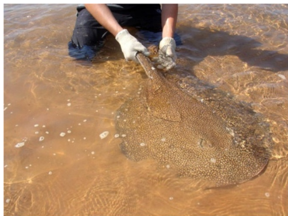
Figure 6 Potamotrygon falkneri , a species common in Paraná River, in Southeastern and Southern Brazil, Uruguay, Paraguay and Argentina.

of Paraná River are sometimes red and pestilential, and lashings of stingrays and scissors-toothed fish keep men screaming all day" [40]. Mariano Castex, a missionary living in Santa Fé, Argentina, carried out studies on various aspects related to freshwater stingrays, especially about their taxonomy, action of toxins and injuries [30-38].