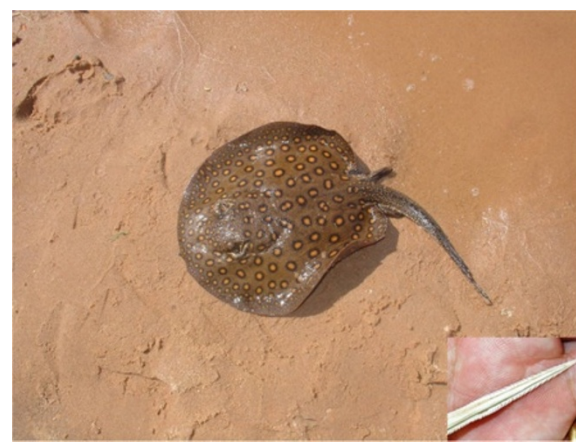
Figure 5 Potamotrygon motoro, the most common species of freshwater stingray. This ray is found in most regions of Brazil.