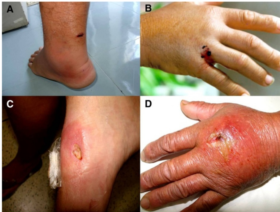
Figure 7 Envenomations caused by marine stingrays. (A) Erythema and edema in a heel injury. (B) Fisherman hand injured by a stingray. (C) Ulcer on the left foot of a fisherman. (D) Hand of a fisherman stung by a ray, the wound was associated with bacterial infection. This kind of injury is common in fishermen of shrimp communities, since the caught stingrays remain at the bottom of the boat.