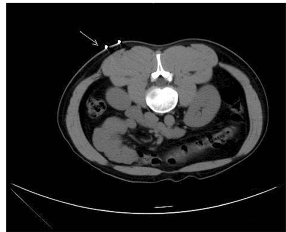
Figure 2 5.0 mm axial CT scan was taken through the lower pole of the kidney to determine the puncture site (Standard-dose scanning).

In conclusion, low dose CT-guided renal biopsy was accurate, safe, and effective. It had the advantages of clearly displaying the regional anatomic location and structure successfully with no or few complications. While this technology is beneficial to all sorts of patients with chronic renal failure or renal atrophy as the interface of renal cortex and medulla is much clear in low-dosed CT scanning, it is especially useful to obtain enhanced images in patients who were obese or had renal atrophy.