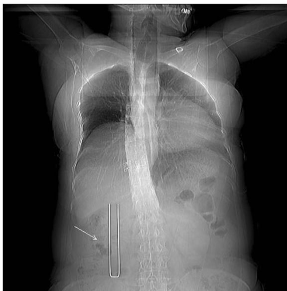
Figure 1 The U-shaped locator (arrow) was placed for skin positioning (topography).

The biopsy gun provided high-quality specimen with little bleeding and rapid action. The action of biopsy gun may be slowed down if used alone, due to the resistance of lumbar muscles in patients. This could result in low-quality specimen and increased chances of bleeding [4]. Nonetheless, in coaxial trocar assisted biopsy, the bard biopsy gun passes through a trocar to minimize the frictional resistance between the biopsy needle and the trocar.