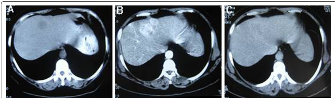
Figure 1 Computed tomography (CT) of the liver. A. Noncontrast CT image shows a low density mass in segment 4 of liver. B, C. Dynamic CT scans show enhanced of the nodule in the arterial phase and early washout in the portal phase.

Histological and immunohistochemistry of the tumor confirmed the findings of the biopsy and the resection line was free from tumor invasion.