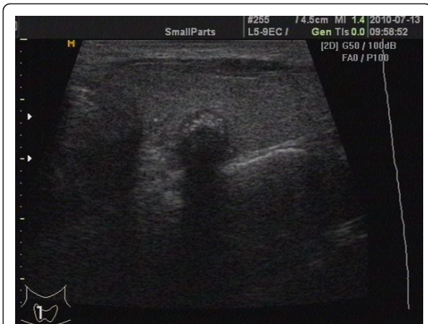
Figure 1 Thyroid microcarcinoma was discovered by screening with ultrasonography.

blinded to the surgical technique used and signed an informed written consent before enrollment to the trial. This prospective randomized trial study was performed on these 105 consecutive patients given total thyroidectomy plus level III-IV and VI dissection (pretracheal, bilateral paratracheal, and prelaryngeal lymph nodes) [6,7]. Patients were randomly assigned to either the Focus group (in which the operation was performed entirely using the Harmonic Focus and no other hemostatic tool; 51 patients) or the classic group (in which the operation was performed using conventional clamp-and-tie technique and mono-polar electric scalpel; 54 patients). The patients all underwent similar treatment following the same protocol, except for the Harmonic Focus used. Total thyroidectomy and level III-IV and VI dissection were performed by the same experienced thyroid surgical team (six adept surgeons) in all cases. The two groups did not display statistically significant differences in term of age, gender, BMI, and pathology classification (Table 1).