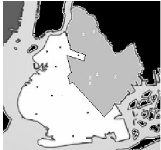
Figure 2 Map of Brooklyn indicating regions with low prevalence (white area) and high prevalence (gray area) for S. aureus USA300 strain. Black circles and white X's represent medical centers in the low and high prevalence regions, respectively.

To determine if patients with cultures positive for the USA300 strain were representative of the population of the high prevalence neighborhoods, records of 20 patients from two medical centers within the higher prevalence region were reviewed. Of the 20 patients, three were \leq 18 years of age and 11 were female. Seventeen of the 20