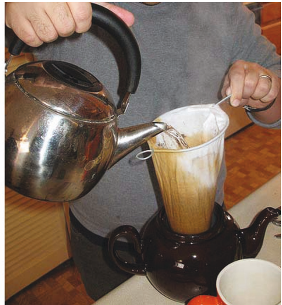
Figure 1 Traditional 'Sock' Method used in Singapore and Malaysia.