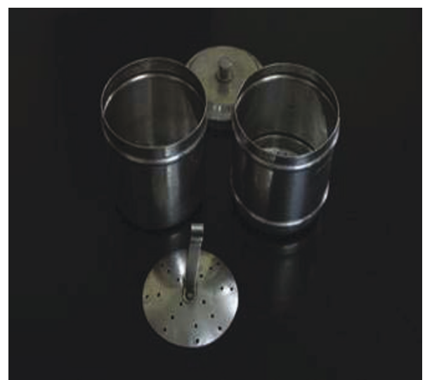
Figure 2 South Indian metal 'filter' coffee instrument. (Creative Commons Attribution-Share Alike 3.0 Unported license. http://en.wikipedia.org/wiki/Indian_filter_coffee )

single cycle. A number of cycles may be performed depending on taste. The South Indian 'filter' coffee method consists of an upper cup which has a pierced bottom, a pierced pressing disc with a central stem handle and a covering lid. This cup nests into the top of another round bottom cup, leaving enough room below