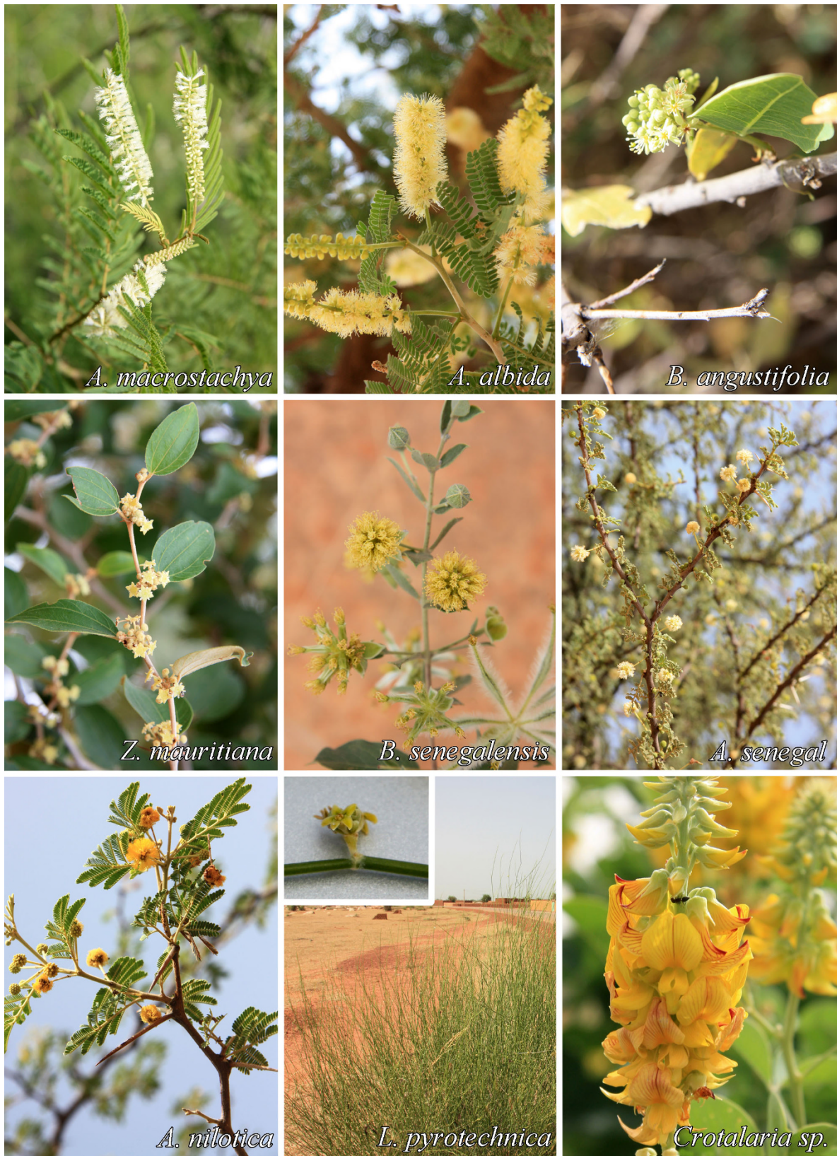
Figure 3 Pictures of the most attractive flowering plants determined for Anopheles gambiae s.l. in Mali.