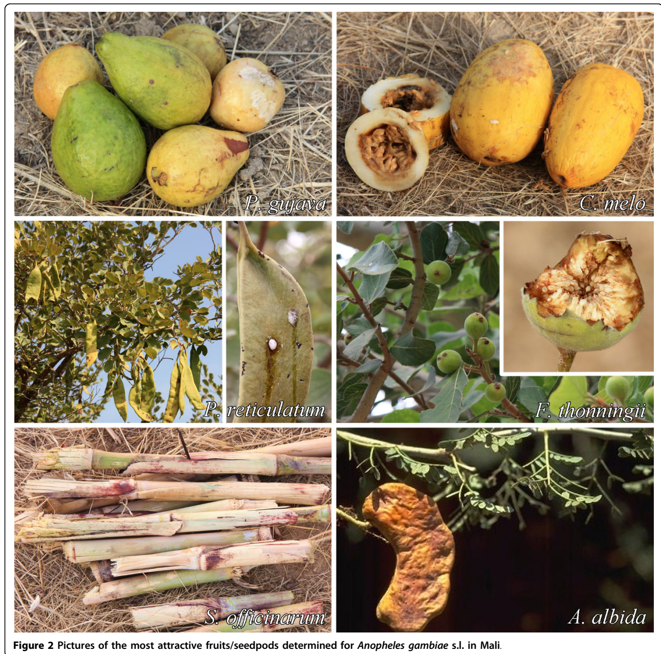
Figure 2 Pictures of the most attractive fruits/seedpods determined for Anopheles gambiae s.l. in Mali.

vectors make are apparently influenced very strongly by the diversity, abundance, and seasonal timing of attractive flowering plants and their products.