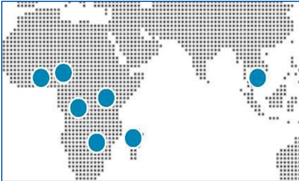
Figure 1 Map of countries included in the project.