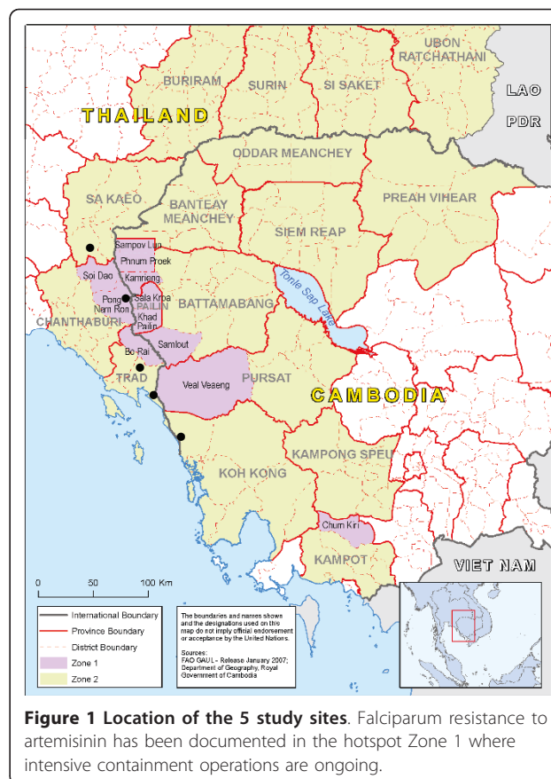
Figure 1 Location of the 5 study sites. Falciparum resistance to artemisinin has been documented in the hotspot Zone 1 where intensive containment operations are ongoing.

The study staff members were health care workers in the study areas and were trained on RDS methodology. After preliminary interviews with the migrants in the communities, the staff selected six seeds per site for a total of 30 seeds, with a goal of reaching the sample size needed in approximately two months. These seeds were given three