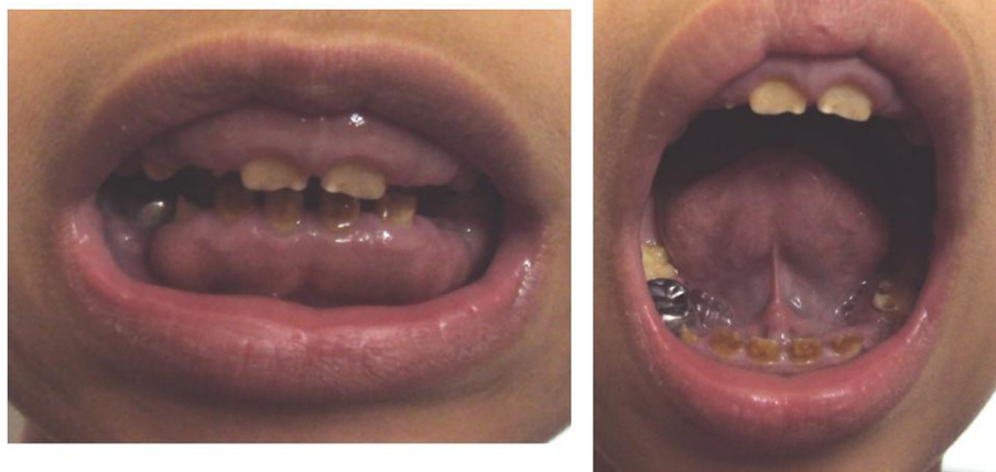
Figure 2 Oral photographs of the proband at the age of 11 years.

Venous blood samples were collected from the patient and his parents. Written informed consent was obtained before genetic testing from the parents. Proband was subject to mutational screening of the entire coding sequence of FAM20A (MIM *611062;