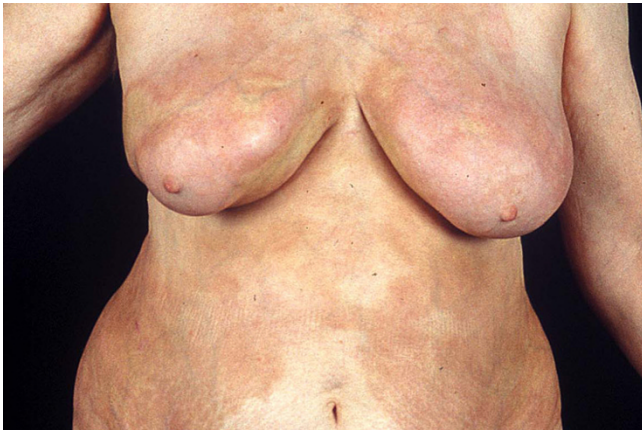
Figure 3 UVA1 phototherapy in localized scleroderma. Macroscopic aspects of LS displaying extensive sclerosis on the chest before (Fig. 3) and after low-dose UVA1 irradiation resulting in a remarkable softening (Fig. 4).