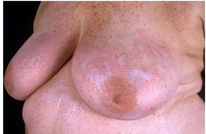
Figure 5 UVA1 phototherapy in extragenital lichen sclerosus et atrophicus. Confetti-like lesions of extragenital LSA (Fig. 5) and marked improvement of following low-dose UVA1 phototherapy (Fig. 6).