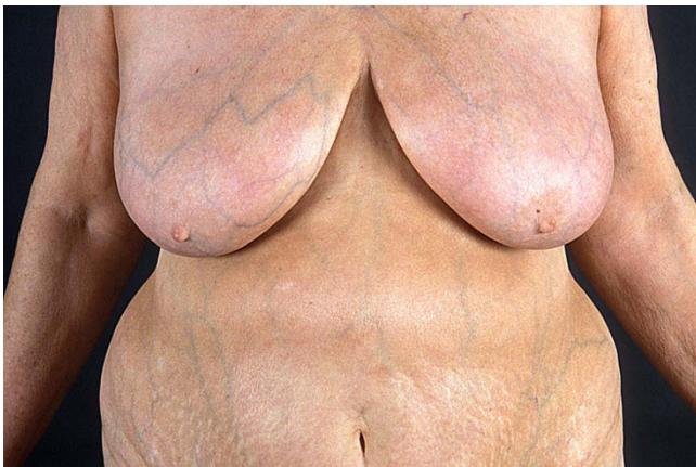
Figure 4 UVA1 phototherapy in localized scleroderma. Macroscopic aspects of LS displaying extensive sclerosis on the chest before (Fig. 3) and after low-dose UVA1 irradiation resulting in a remarkable softening (Fig. 4).