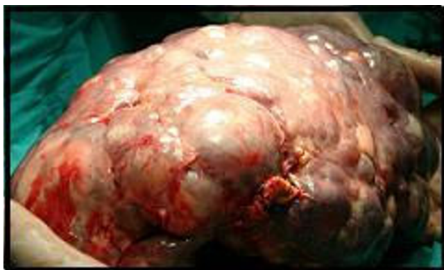
Figure 3 Intraoperative view of the cystic lenfangiomas in the spleen.

Parasitic and non-parasitic cysts of the spleen have a very similar clinical presentation, but due to their differences in diagnosis and treatment, it is important to distinguish the two. The majority of splenic cysts, both parasitic and non-parasitic, are found incidentally on imaging [4]. Splenic cysts grow slowly and are characterized by a long period of asymptomatic latency, such that initial diagnosis is usually established during the course of investigations carried out for other diseases. When the cyst reaches a considerable size, its clinical presentation is normally a result of pressure on adjacent viscera, and may include renal arterial compression with systemic hypertension,