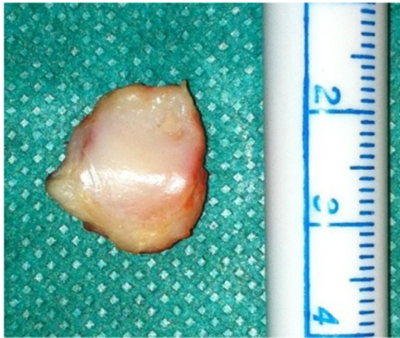
Figure 3 Resected fabella with cartilaginous surface.