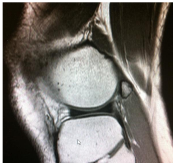
Figure 1 Sagittal view of lateral right knee showing the fabella in close topographical relation to the posterior lateral femoral condyle embedded in the lateral head of gastrocnemius muscle.

Patient B underwent bilateral knee arthroscopy before presenting to our department with complaints of persisting pain during sports in the posterolateral aspect of the right knee. Similar symptoms occurred in both sides. MRI images and pictures of the resected fabella are shown in Figure 1, 2, 3, 4 and 5.