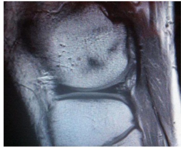
Figure 5 Sagittal view after 3 month after resection of the fabella; intact posterolateral capsule & gastrocnemius muscle with little scar tissue.