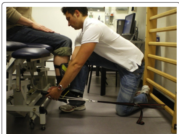
Figure 3 Clinical assessment of muscular isometric knee flexion strength using a modified hand-held dynamometer.

When analyzing this study's reliability using the SEM and SDD, high measurement error was indicated. Previous studies evaluating HHD, in contrast, have demonstrated only low to moderate measurement error in terms of SEM and SDD [14,22]. These studies, however, were performed on other populations and used non-modified HHD [14,22]. Results of the current study would, therefore, be more comparable with a study by