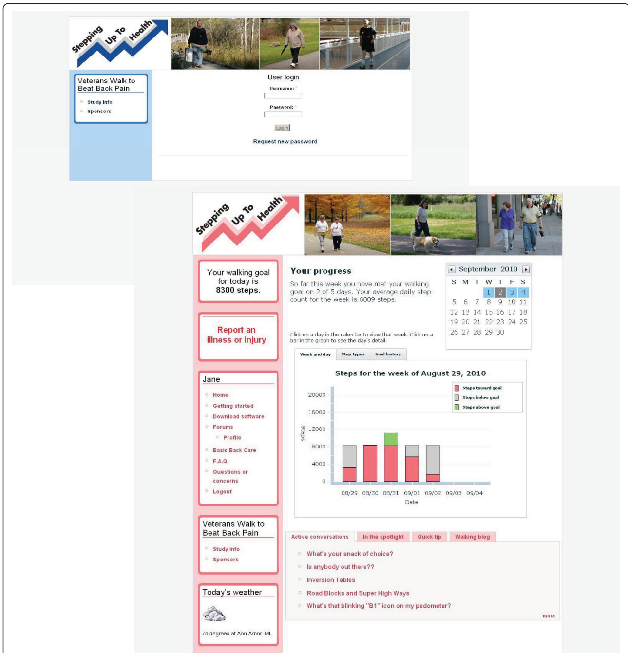
Figure 3 Screen shots of study website. The screen shots show the login page, the graphical and text feedback provided to an intervention participant and a list of active e-community topics. The screen shots also show the tailoring by gender, with variations in color and the photos that are displayed.

such as improvements in mood and quality of life, are also of significant interest. Data collection includes a computer-based survey completed at baseline, 6 months and 12 months, a six-minute walk test conducted at baseline and 12 months, and the step counts collected when participants upload their pedometer data. We are also collecting quantitative information about patients'