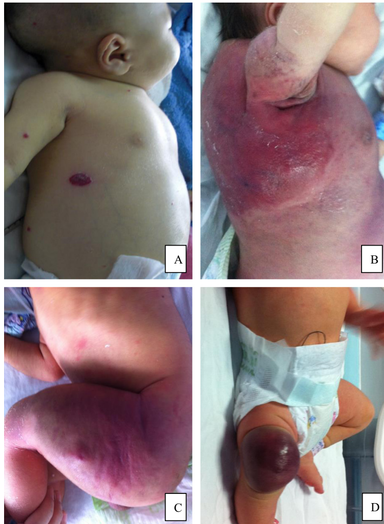
Figure 1 Images of four patients. (A) The patient with multiple cutaneous hemangiomas (more than 20 hemangiomas of different sizes) and multiple hepatic hemangiomas. (B) The patient with cutaneous hemangiomas on back and axilla. (C) The patient with cutaneous hemangiomas on left leg. (D) The patient with cutaneous hemangiomas on right knee.

withdrawn over the following 1–2 months, after which patients were discharged on medication. The six patients who responded well to steroid therapy were regularly followed up at the hospital. In three patients, the platelet counts remained normal for the following year. The hemangiomas did not enlarge or bleed, and regressed within 1–2 years. In the other three patients, the platelet counts subsequently decreased (at 30 days, 3 months, and 5 months after treatment), and they were re-admitted to hospital and underwent arterial embolization. No relapses were observed over the following year.